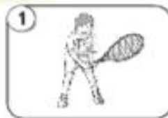
1 play _____ (nentis)