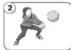
2 play _____ (yevallball)