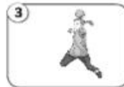
3 play _____ (bahldaln)