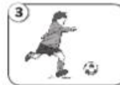
3 play _____ (bofotlal)