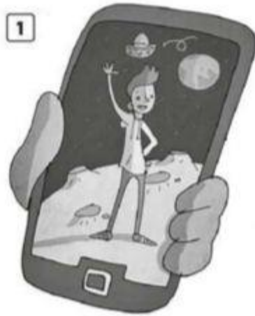
a fake photo

artificial fake female male natural ordinary real special