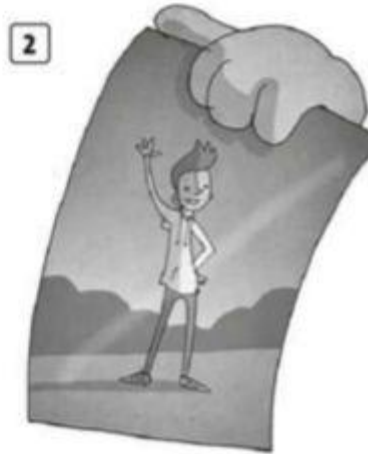
a _____ photo