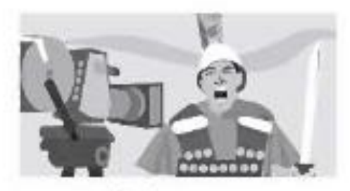
2 musician _____