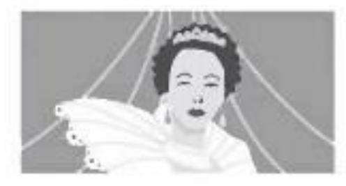
6 scientist _____