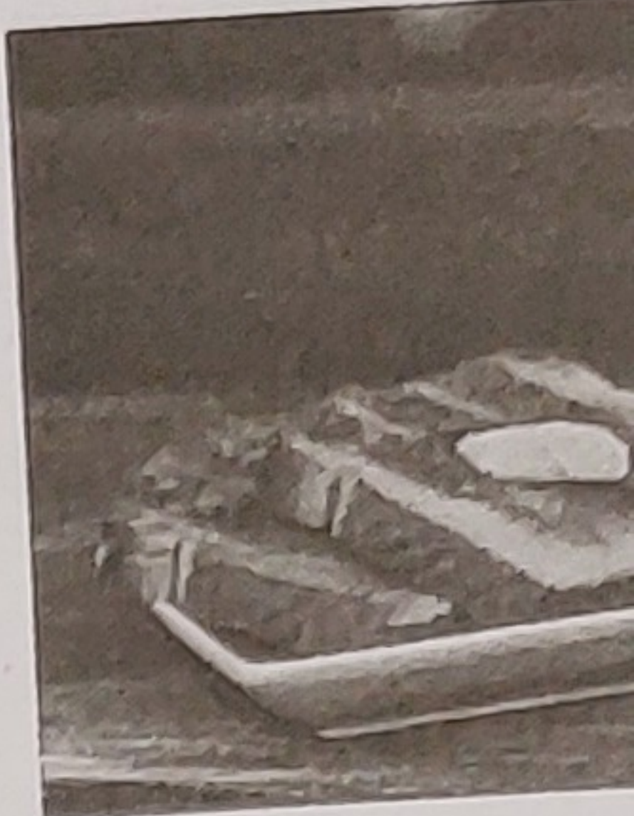
1 We eat cereal with honey for breakfast.