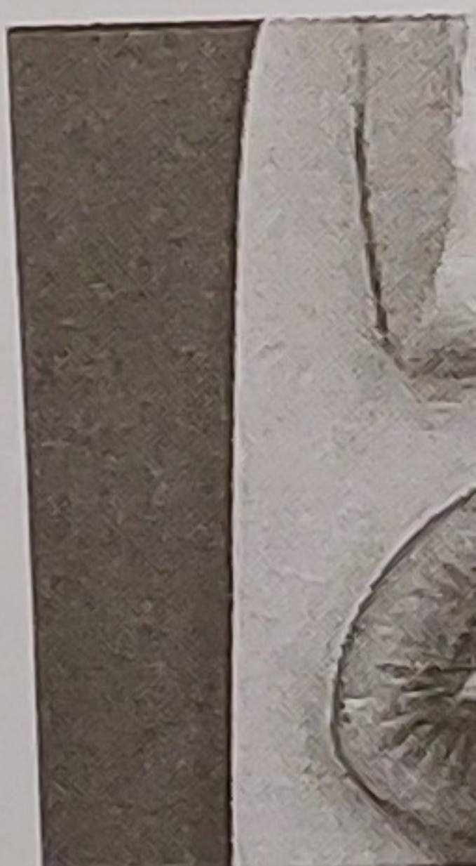
4 I usually drink juice for lunch.