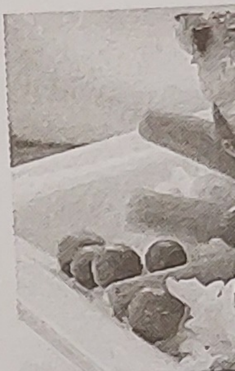
3 Yesterday I ate a mango for dessert.