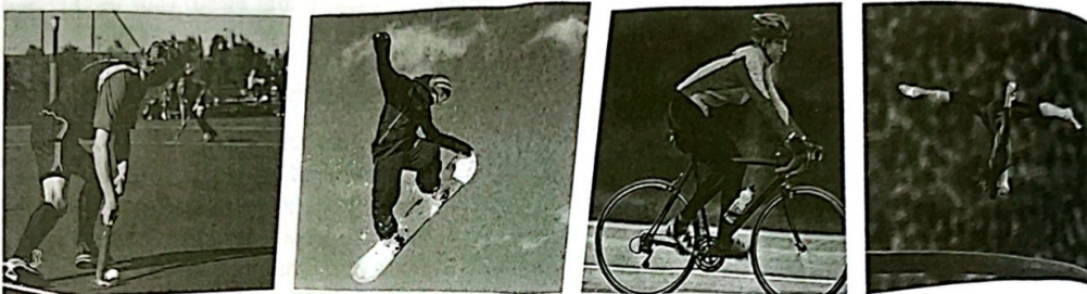
4 _____ 5 _____ 6 _____ 7 _____