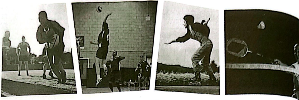
0 rugby 1 _____ 2 _____ 3 _____

athletics badminton baseball cycling gymnastics hockey rugby sailing skating snowboarding surfing table tennis volleyball