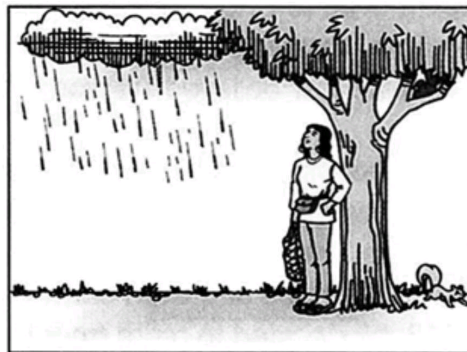
2nd: It began to rain.