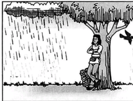
2nd: Rita stood under a tree.