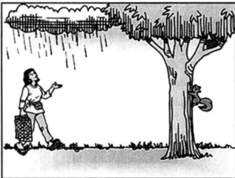
1st: It began to rain.