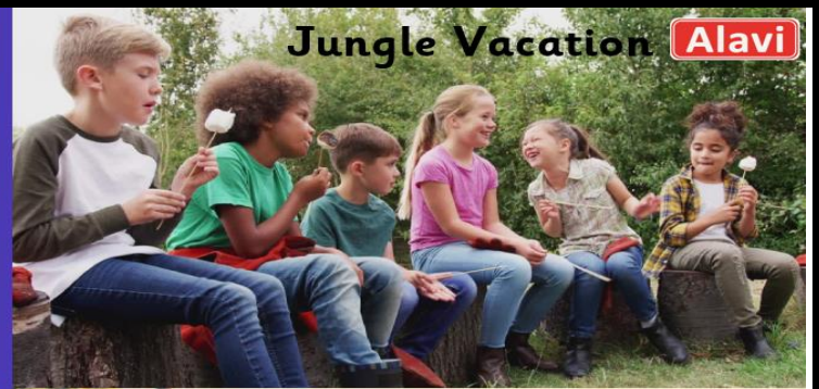
Jungle Vacation Alavi