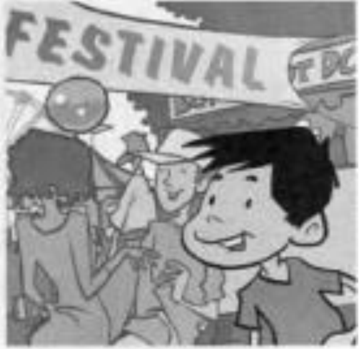
5 _____a festival