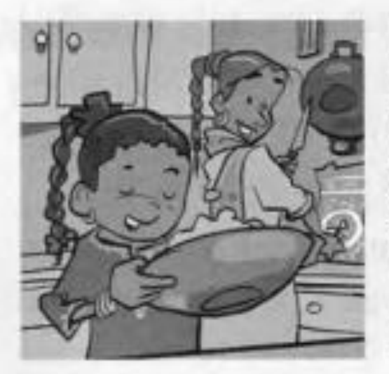
4 ____ nice food