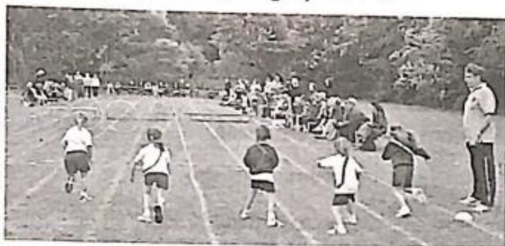
Races at Sports Day