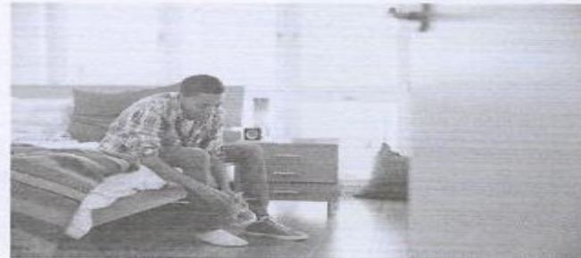
9 Put on your shoes