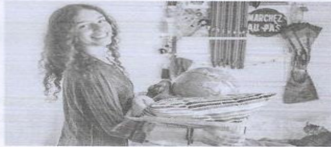
5 tidy your room