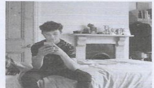
4 check your messages