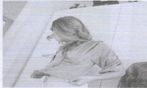
2 get dressed