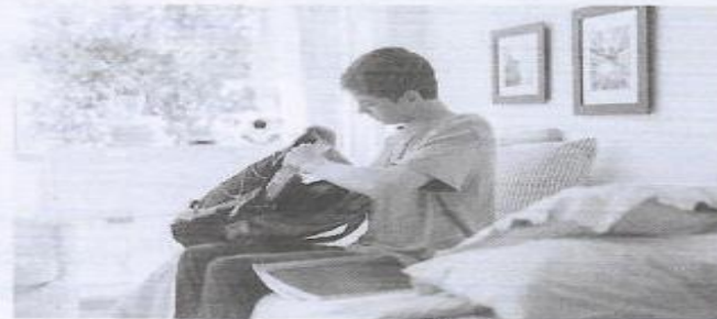
6 Prepare your bag