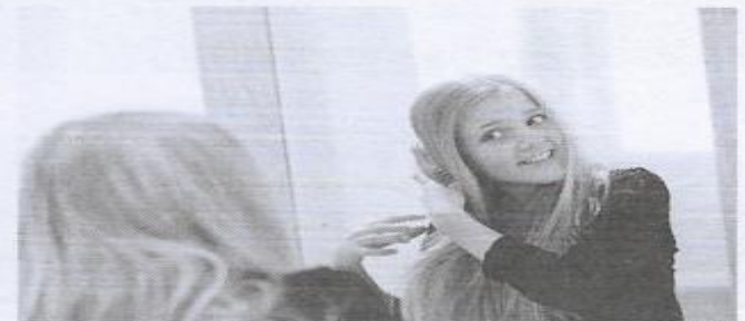
7 brush your hair