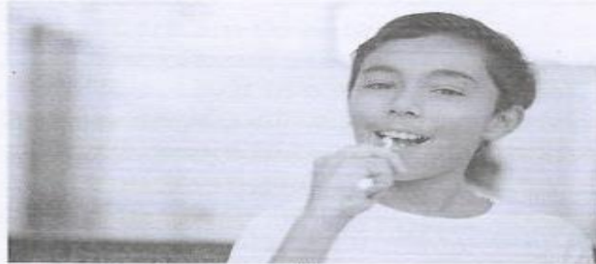
8 clean your teeth