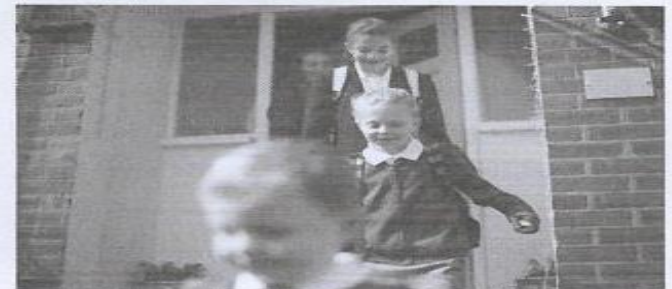
10 leave the house