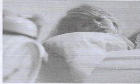
1 Wake up