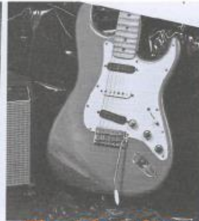
2 Electric guitar