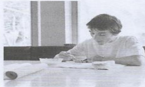
3 have breakfast