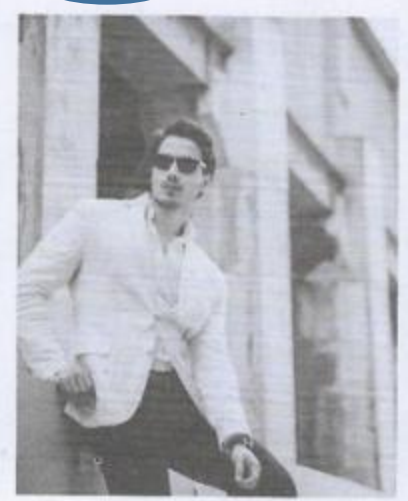
7 He's a photographer / model