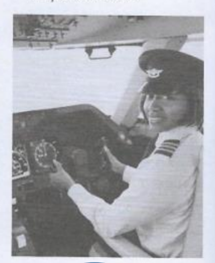
8 She's a pilot | nurse.