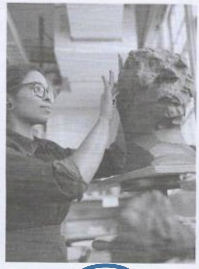
4 She's a artist a sports coach.