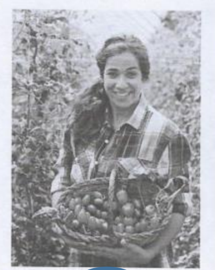
1 She's a farmer mechanic.