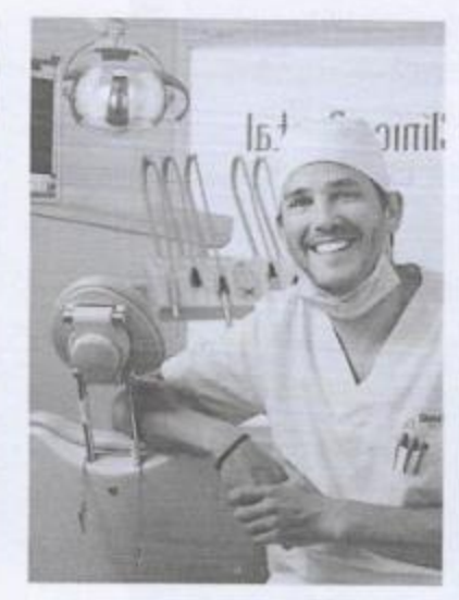
3 He's a police officer / dentist.