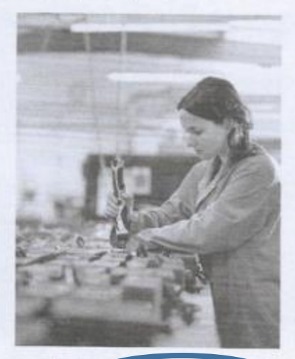
6 She's a factory worker | shop assistant.