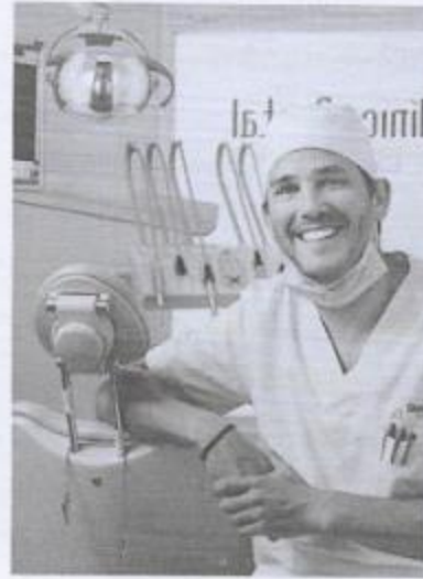
3 He's a police officer / dentist.