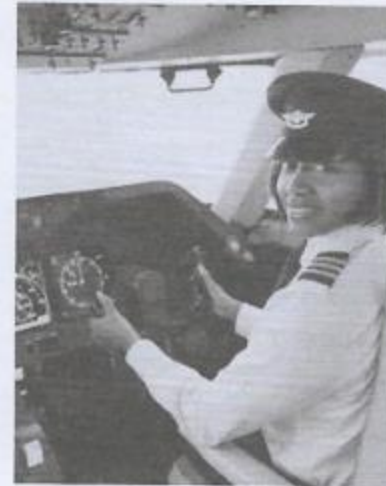
8 She's a pilot / nurse.