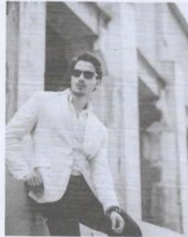
7 He's a photographer / model .