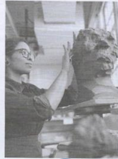
4 She's a artist / a sports coach.