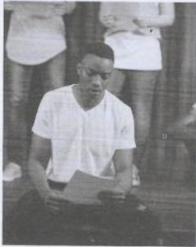
5 He's a manager / actor .