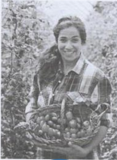
1 She's a farmer / mechanic.