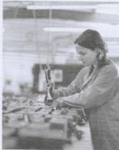
6 She's a factory worker / shop assistant.