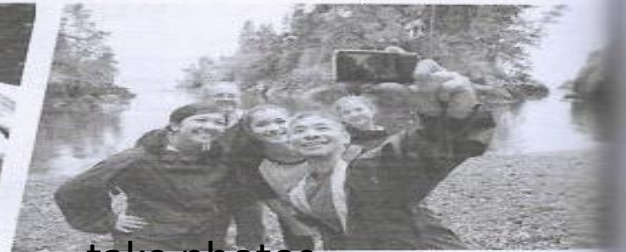
4 take photos