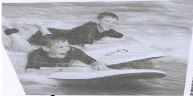
1 Do watersports