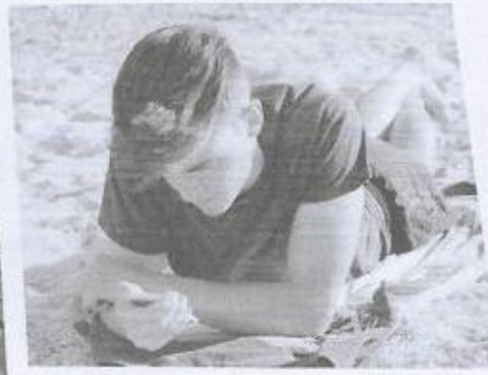
6 lie on the beach