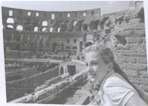
5 Go sightseeing