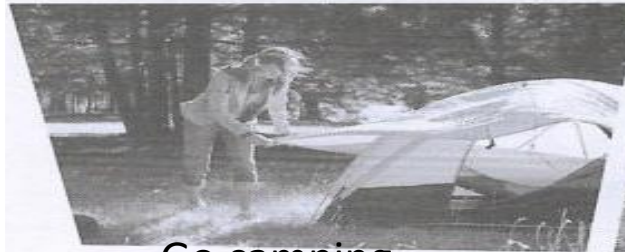
3 Go camping