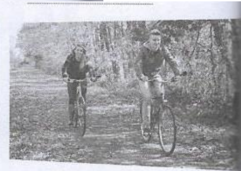
8 ride a bike