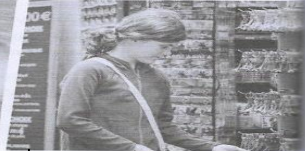
2 buy presents