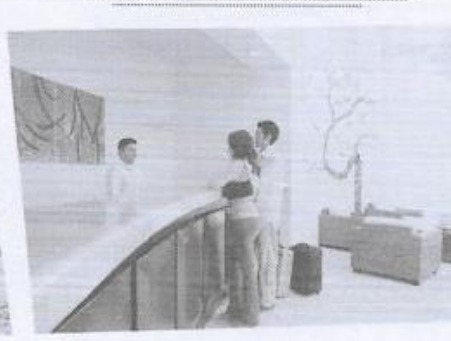
7 stay at a hotel