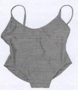
3 swimming costume 4