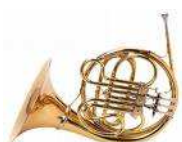
16 French horn