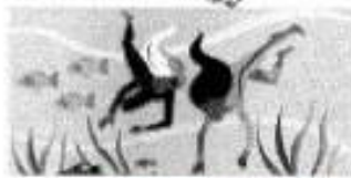
1 swim underwater