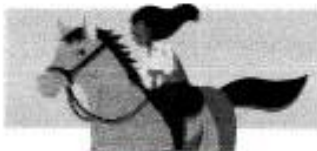
3 ride a horse