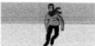
10 ice skate