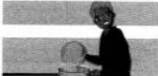
8 cook spaghetti