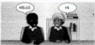
5 speak English