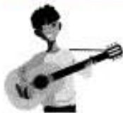
2 play the guitar