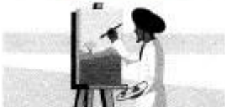
4 paint a picture