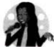
6 sing songs