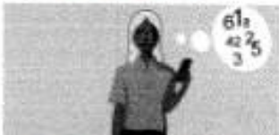
9 remember phone numbers