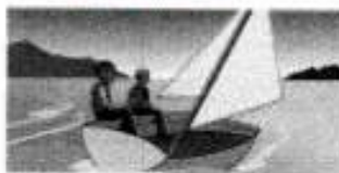
7 sail a boat