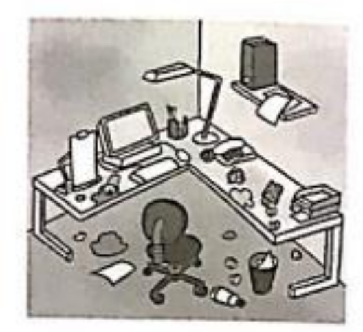
The office is quite dirty