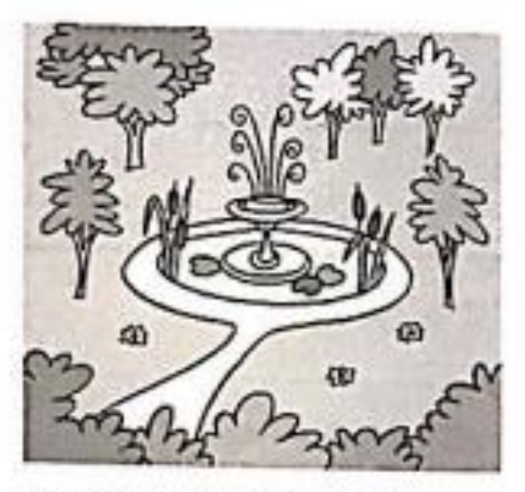
4 The park is really