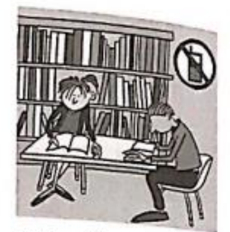
I The library is very _____