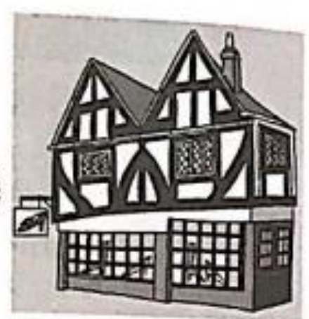
3 The shop is really _____