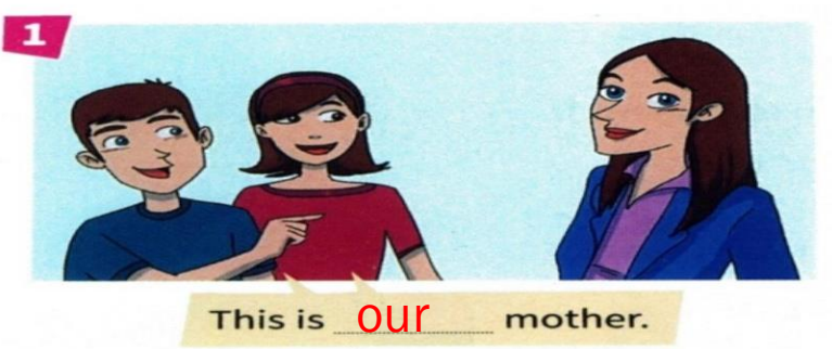
Complete the sentences with their or our .