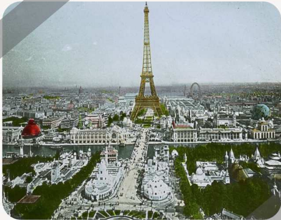
The Eiffel Tower in Paris.