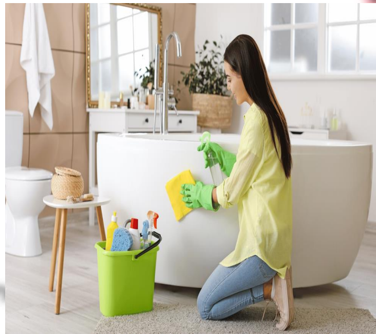
She is cleaning the bath.