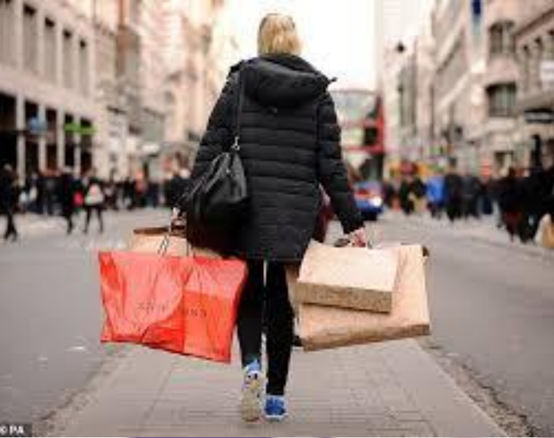
She is carrying the shopping.