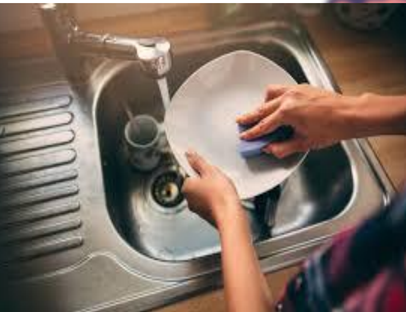
She is doing the washing up.