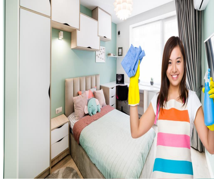
tidy your room