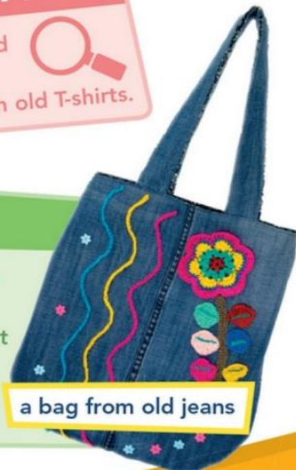
a bag from old jeans