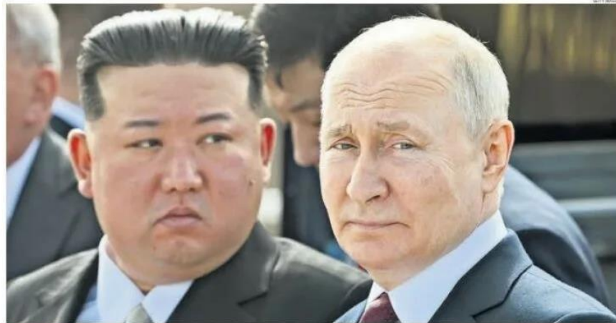
Show of support Kim Jong-un pledged North Korea's backing for "Comrade" Putin's battle in Ukraine after they met for four hours in eastern Russia yesterday. Page 32

sensitive waterways. Labour had been expected to abstain on the move but decided at the 11th hour to side with the Greens, Liberal Democrats and Tory rebels. Instead they said the government should allow developers to start building homes that are in the planning process but require them to introduce measures Continued on page 2