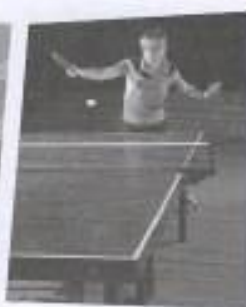
9 table tennis