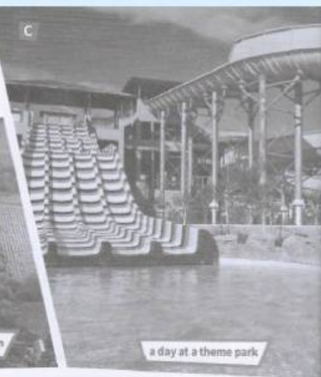
a day at a theme park