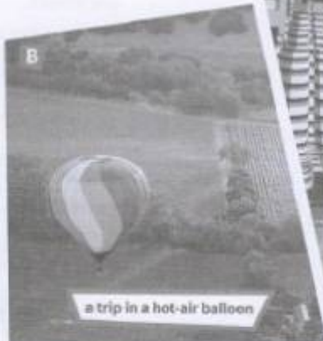
a trip in a hot-air balloon