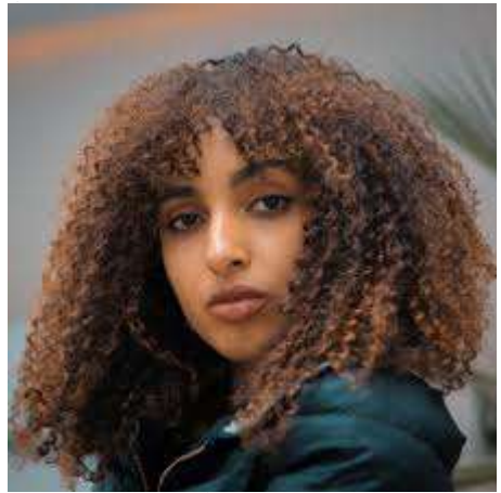
She has got long curly black hair.