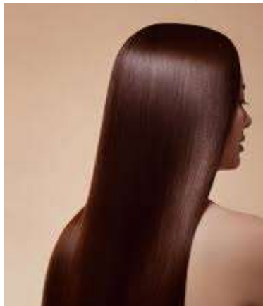
She has got long straight black hair.