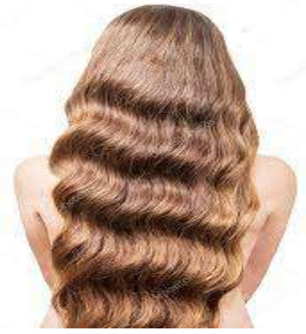
She has got long wavy brown hair.