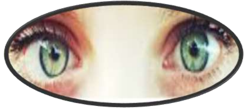
She has got green eyes.