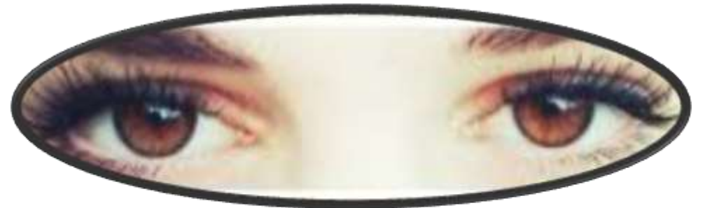
She has got brown eyes.