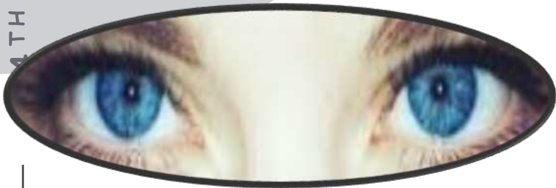
She has got blue eyes.