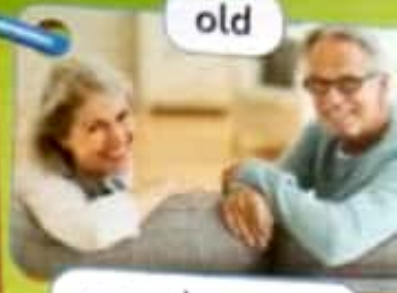
grandparents grandma and grandad