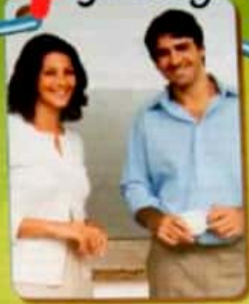
parents mum and dad