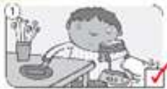
(set the table)