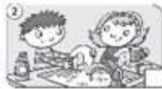
(dry the dishes)