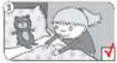
(make my bed)