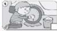
(wash the car)