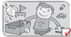
(tidy my bedroom)