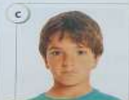
light brown hair