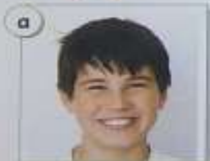
short black hair