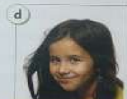
dark brown hair