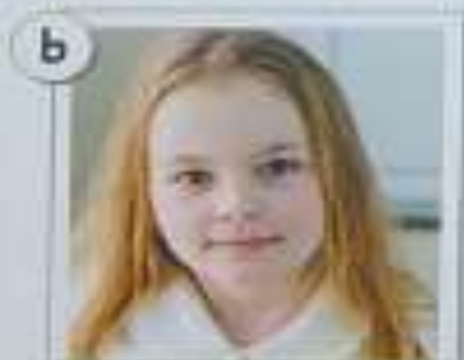
long fair hair