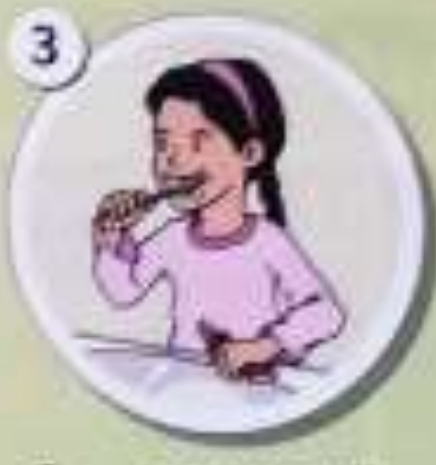
I ... my teeth.