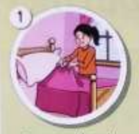
I ... my bed.

Complete the sentences. Listen and check.