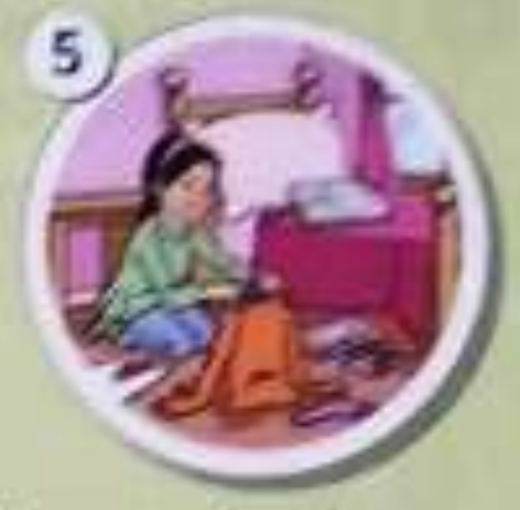
I ... my bedroom.