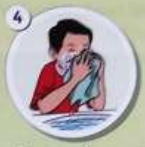
I ... my face.