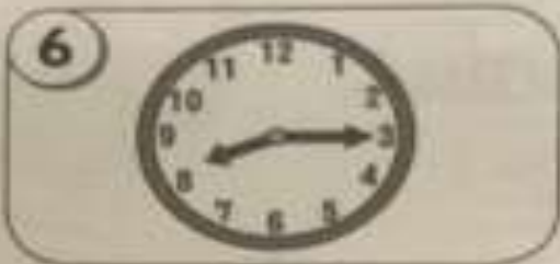
Quarter past eight