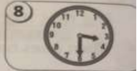
Half past three