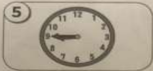
Quarter to nine