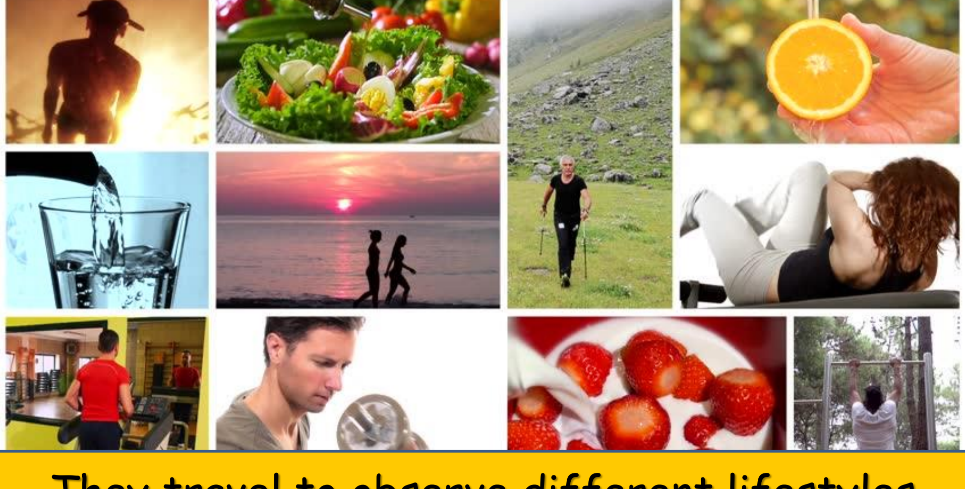
They travel to observe different lifestyles