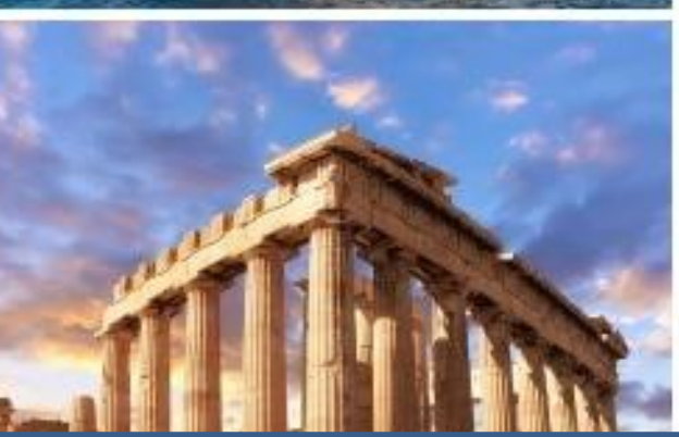
They travel to visit the landmarks