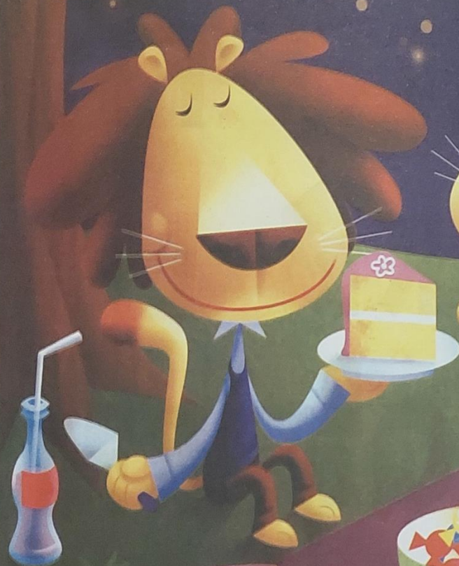
3. soda pop