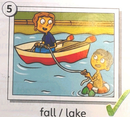
fall / lake