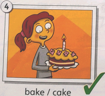
bake / cake