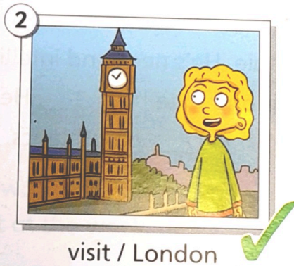
visit / London