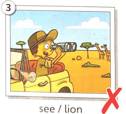
see / lion