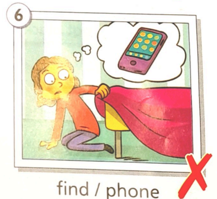
find / phone