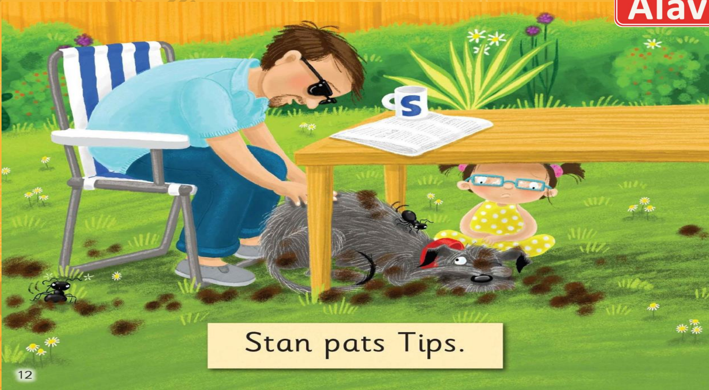
Stan pats Tips.