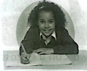
do my homework