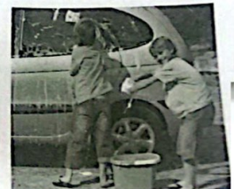
wash the car