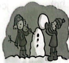
make a snowman