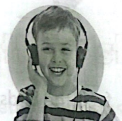
listen to music