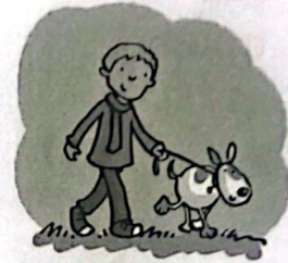
go for a walk