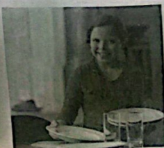
set the table