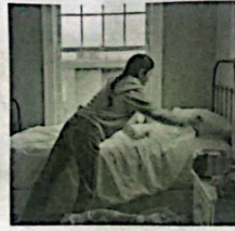
make my bed