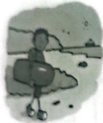
go to the beach