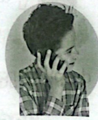
talk on the phone