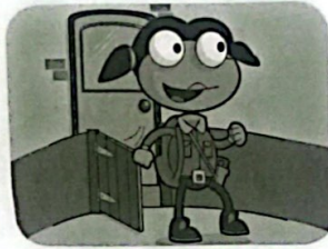
go to school