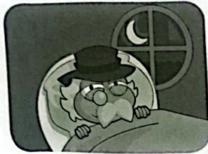
go to bed