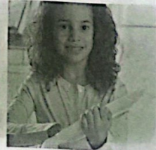
dry the dishes