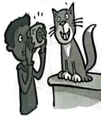
take a photo