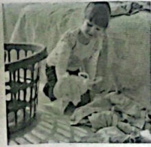
tidy my bedroom