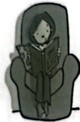
read a book