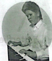
play the piano