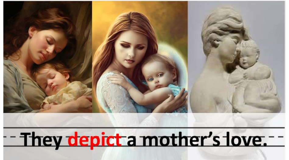
They depict a mother's love.