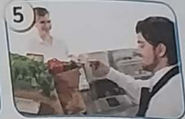
5 sales assistant