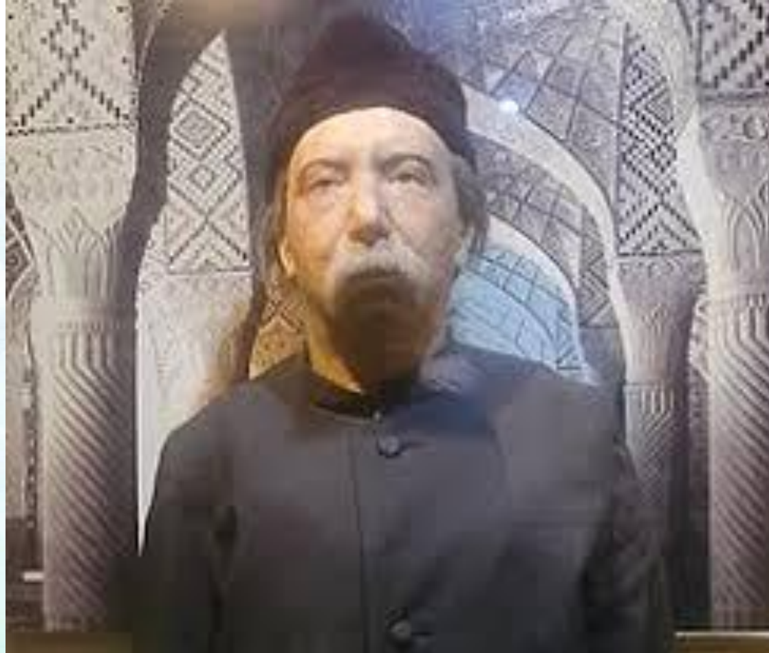
ruler of Fars