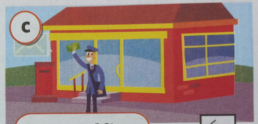
c post office