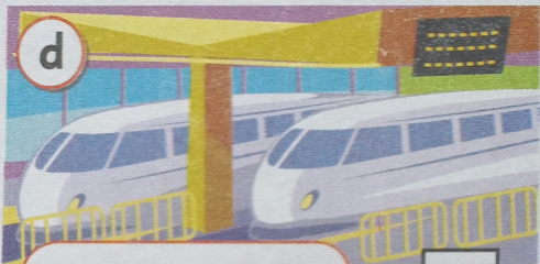
d train station