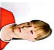
She isn't very happy.