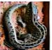
A lizard is a reptile.