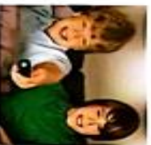
They weren't doing sports.