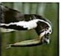
A penguin eats fish.