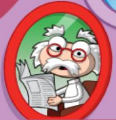
read the newspaper