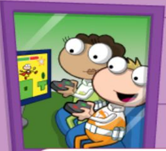
play computer games