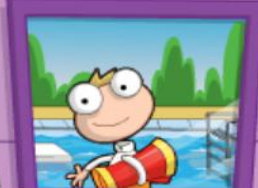
go to the pool