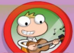
play the guitar