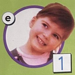
e Move your head.