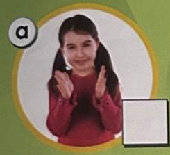
a Clap your hands.