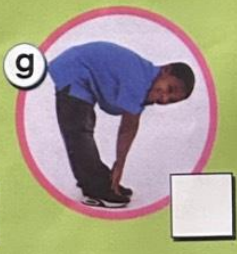
g Touch your toes.