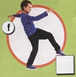
f Kick your legs.