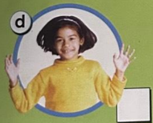
d Wave your arms.