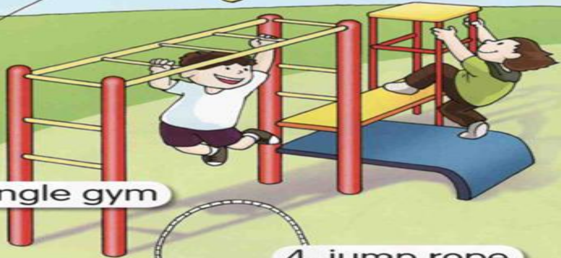
1. jungle gym