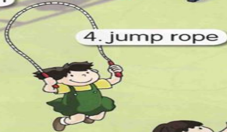
4. jump rope