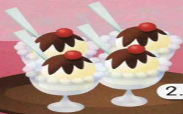
2. ice cream