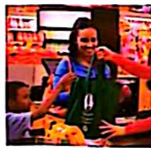
Don't use plastic bags.