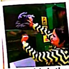
Give old clothes to other people.