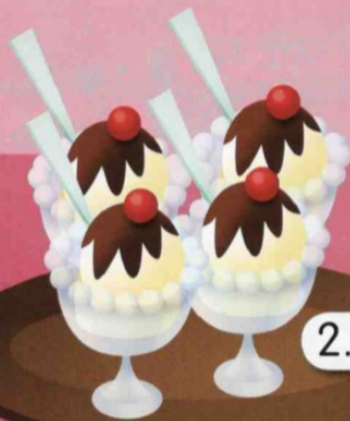
2. ice cream