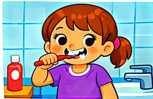
I brush my teeth.