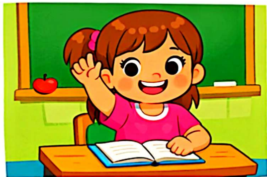
I sit in my class.