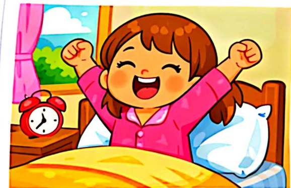
I wake up.