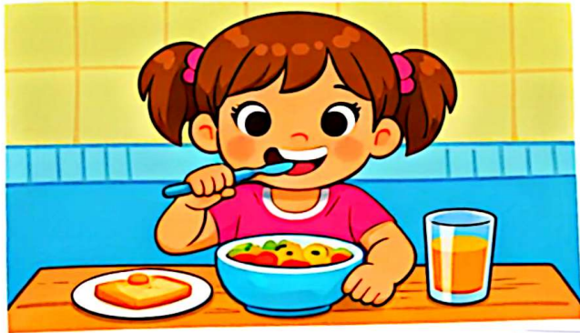
I eat breakfast.