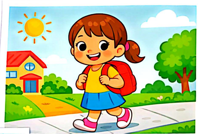
I walk to school.