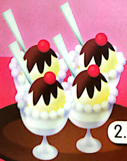
2. ice cream