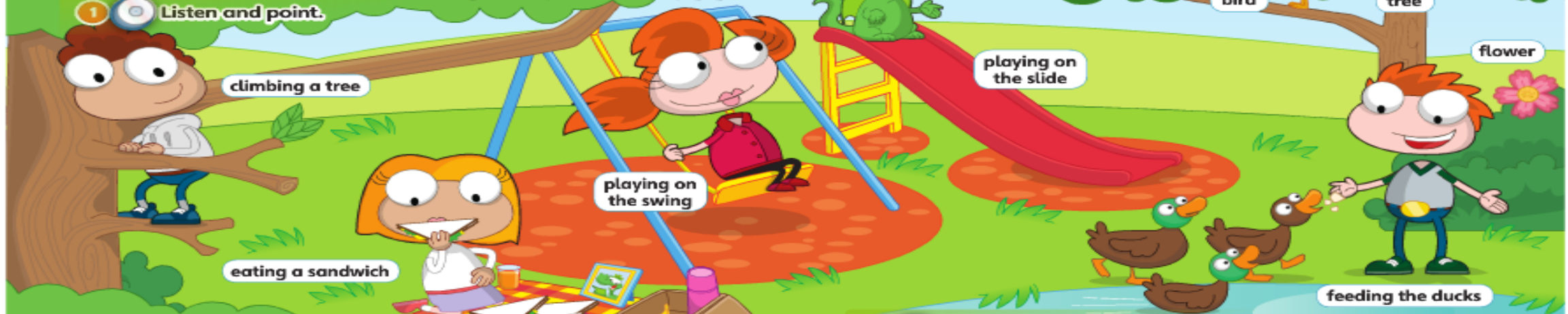
climbing a tree