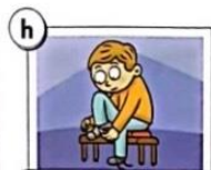
learn to tie my shoelaces