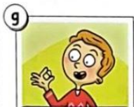
lose my first tooth