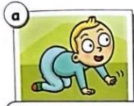
learn to crawl

7 Listen and repeat the sentences. How old were you when you learnt to tie your shoelaces?