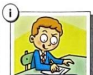
learn to write