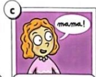
learn to talk