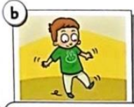
learn to walk