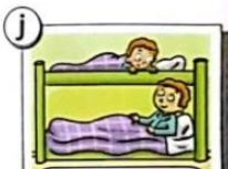
share a bedroom

8 Read and guess the missing words. Then listen and sing.