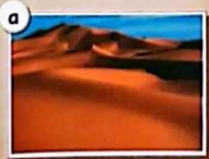
There are deserts in Egypt.

29 Look at the photos. Talk about the weather in these countries.