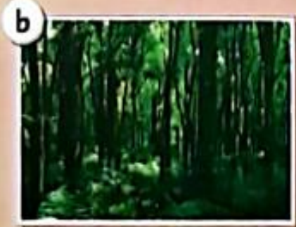
There are rainforests in Brazil.