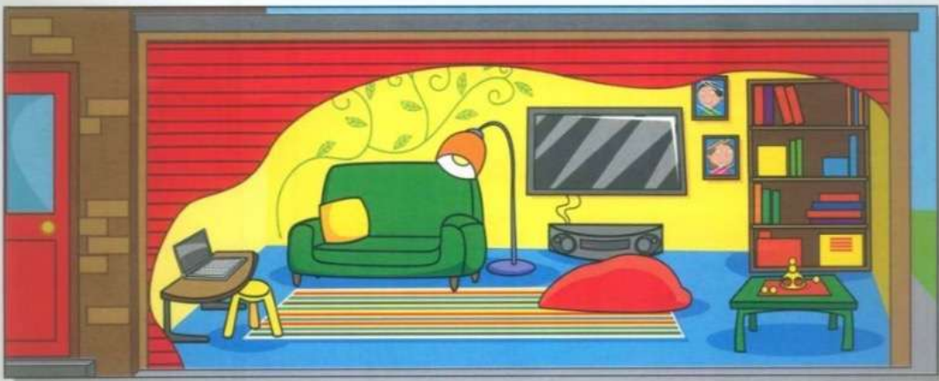
table sofa bed bath fridge lamp

11 Read the text. Where is the playroom?